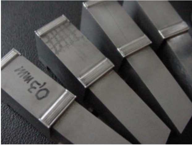
Bar Tools Welding Additive dia. 0,3 mm